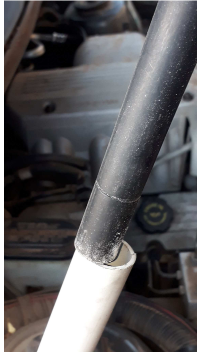
Conduit under strut body to hold bonnet open So simple, so effective.